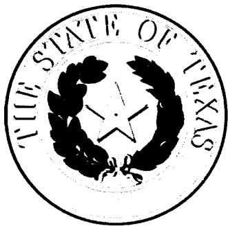
GREG ABBOTT, GOVERNOR OF TEXAS